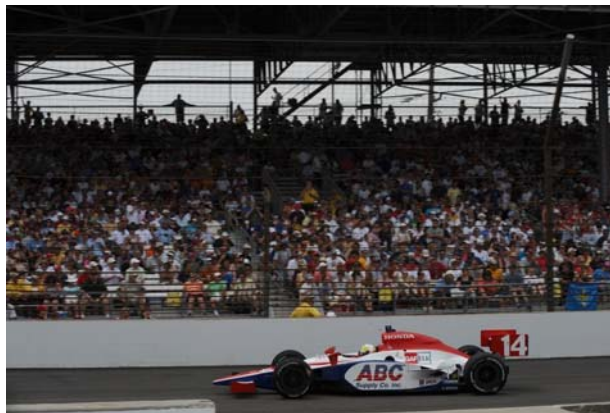
Vitor Meira on track at Indianapolis Motor Speedway during the Indy 500

The driver of the No. 14 ABC Supply car for the upcoming ABC Supply/A.J. Foyt 225 at the Milwaukee Mile has yet to be determined although a decision will be made by Tuesday afternoon. The race will be televised on ABC-TV starting at 3:30pm eastern time.